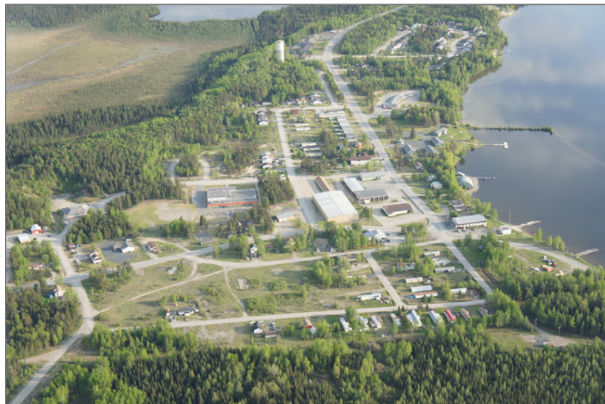
Aerial view of Municipality of Pickle Lake