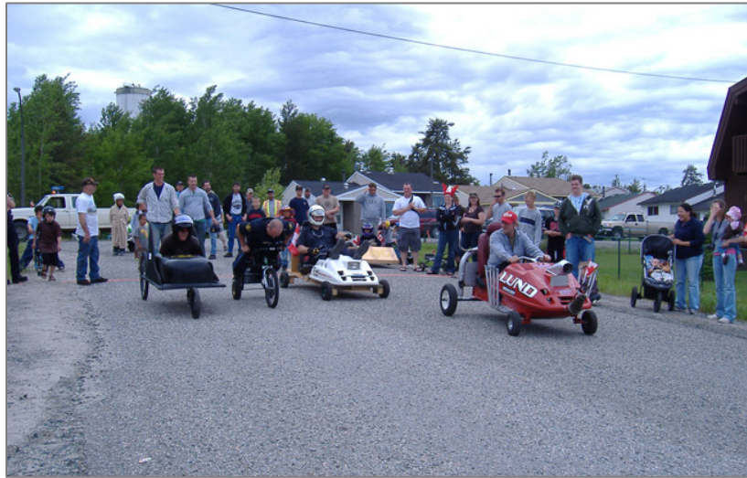
Pickle Lake Soap Box Derby