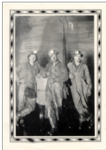
Mining crew (Pickle Lake)