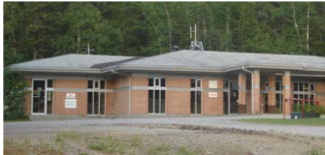
Pickle Lake Health Clinic Building