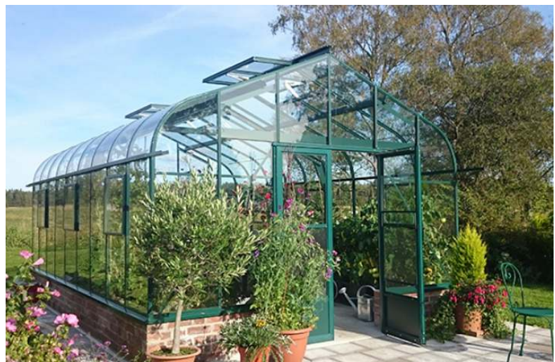
Above is an example of what the Sungarden greenhouse looks like