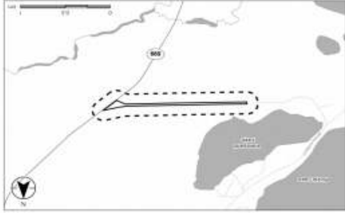
Schedule B Municipal Class Environmental Assessment "Connecting Link"

On behalf of the Township of Pickle Lake, Stantec Consulting Ltd. has completed a Municipal Class Environmental Assessment (EA) for the "Connecting Link" (the Project) to identify a preferred solution for a new road extension to provide a secondary means of access to the Township of Pickle Lake. The study concluded that the preferred alternative is the extension of Koval Street South by approximately 1.5 km to Highway 599. The preferred alignment area is outlined on the adjacent key plan. The purpose of the Project is primarily to provide a secondary access to service the Township of Pickle Lake during emergency situations, while also enhancing safety and reducing traffic volumes through the downtown core and providing future development opportunities near the airport.